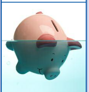
Taxes: To Transition Now or Later