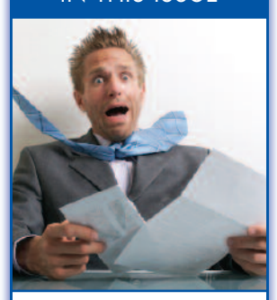
Death & Taxes