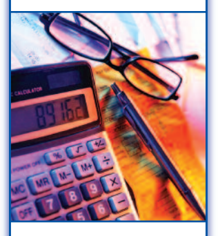
New IRS Audits